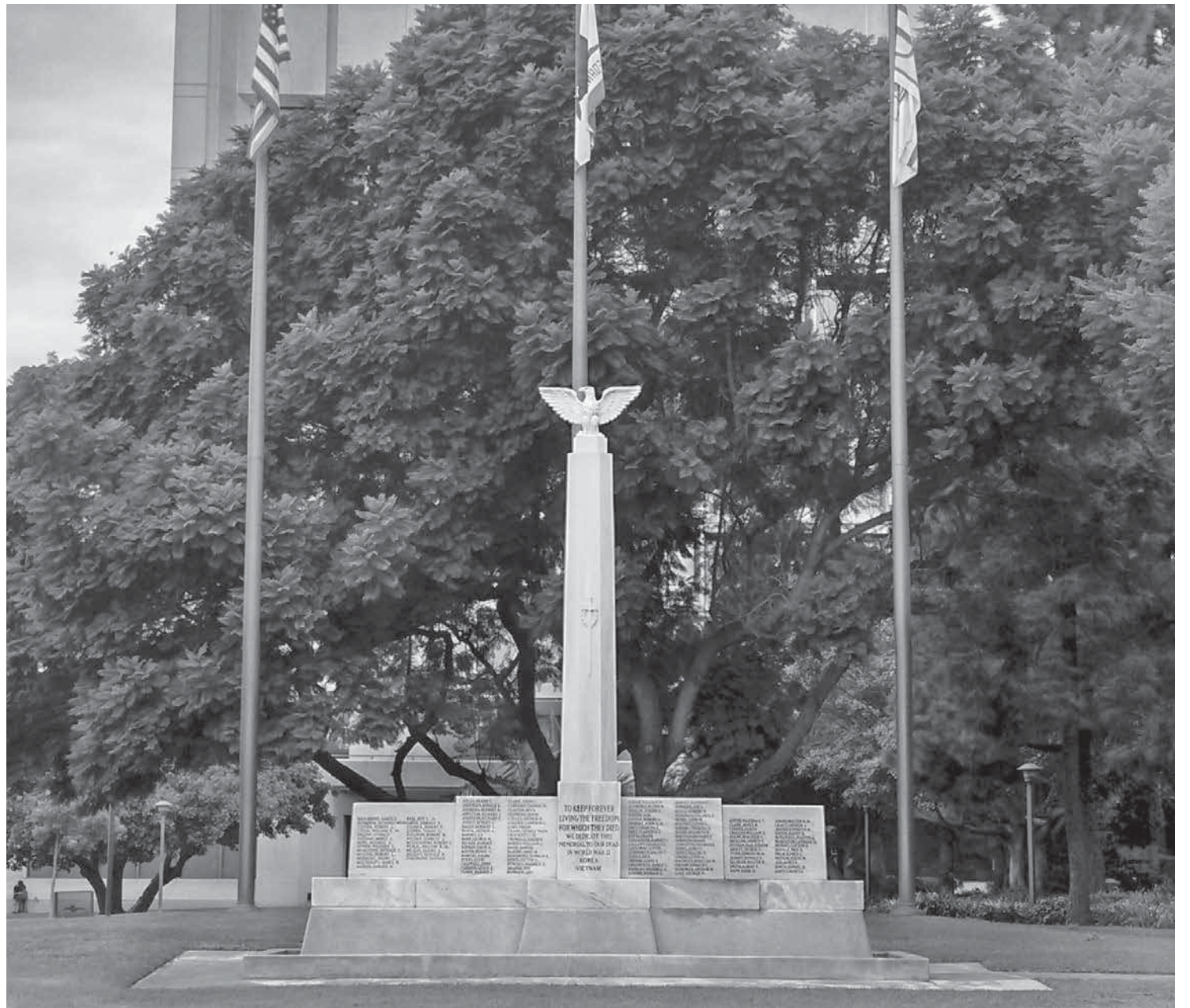
On a small, grassy plaza at Inglewood's City Hall stands the Memorial Obelisk Monument. Supported by a stone panel at its middle, the memorial is engraved with the phrase, "To keep forever living the freedom for which they died. We dedicate this memorial to our dead in World War II, Korea and Vietnam." The names of those who perished are on either side of the memorial. In the middle is a column with a sword and wreath, and on top, an eagle.